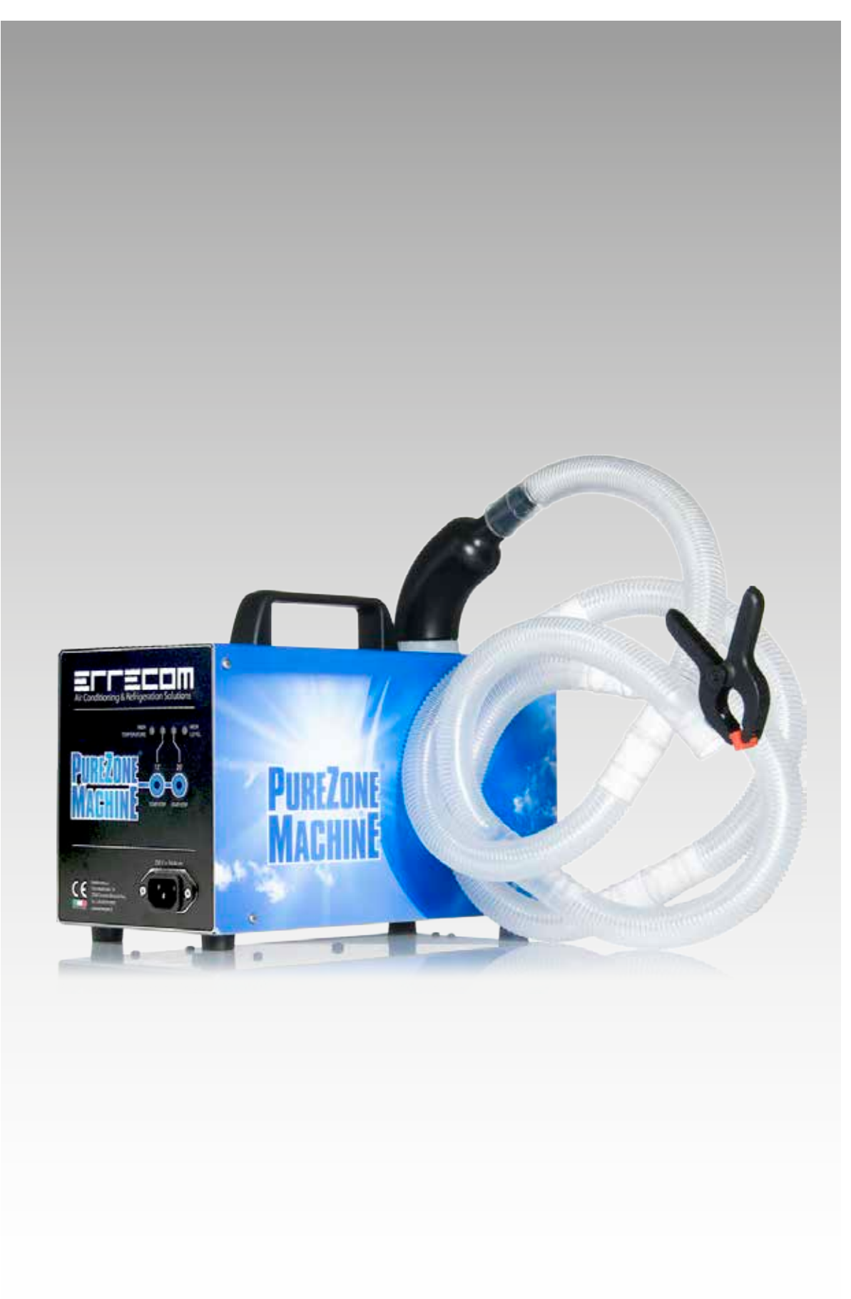
PURIFYING TREATMENTS FOR INTERIORS