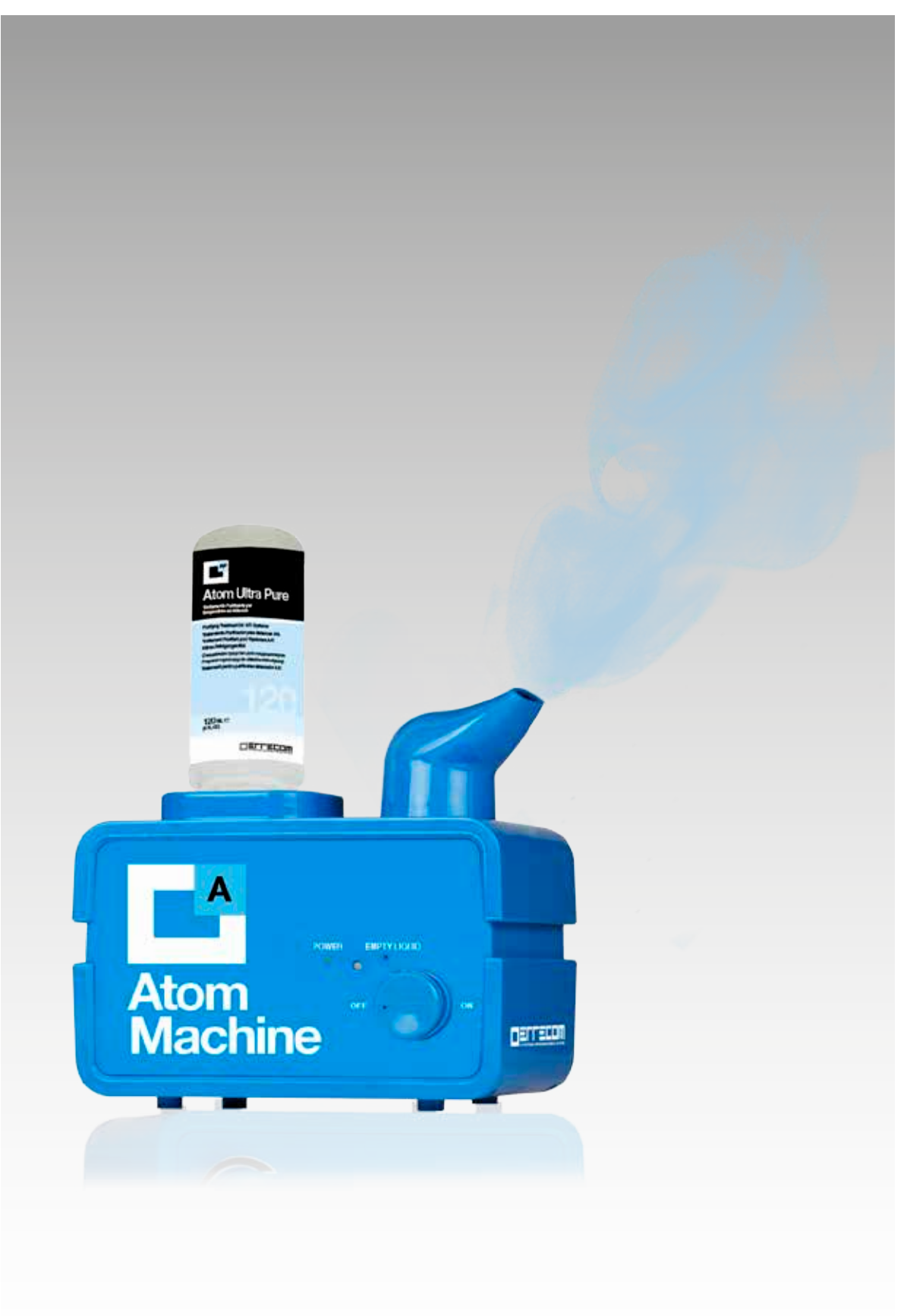
PURIFYING TREATMENTS FOR INTERIORS