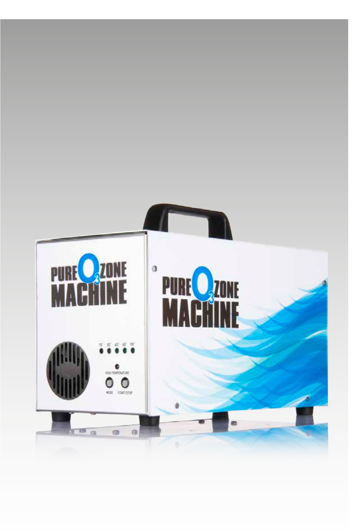
PURIFYING TREATMENTS FOR INTERIORS